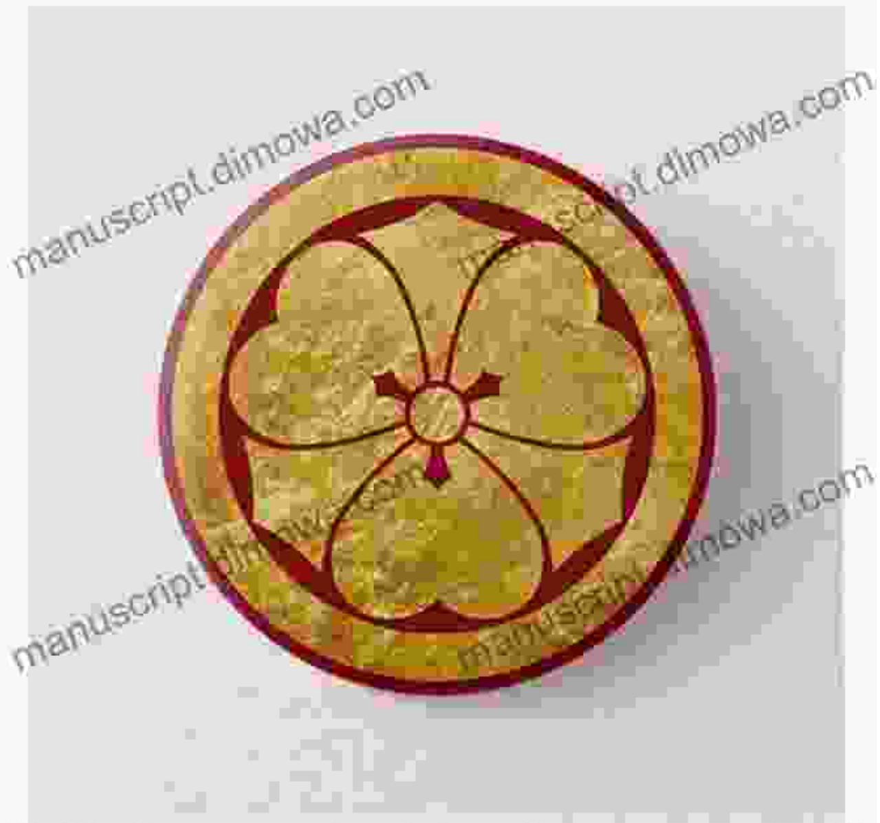
Sakai Mon Japanese samurai clan faux ... by ejkaal