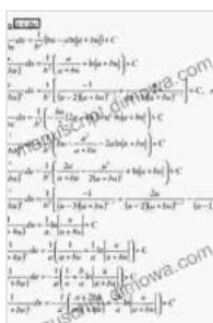
Table of Integrals, Series, and Products by Daniel Zwillinger