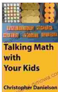
Image Alt: The book "Talking Math With Your Kids" rests on a table, next to a colorful array of math manipulatives and a smiling child looking at a mathematical equation.