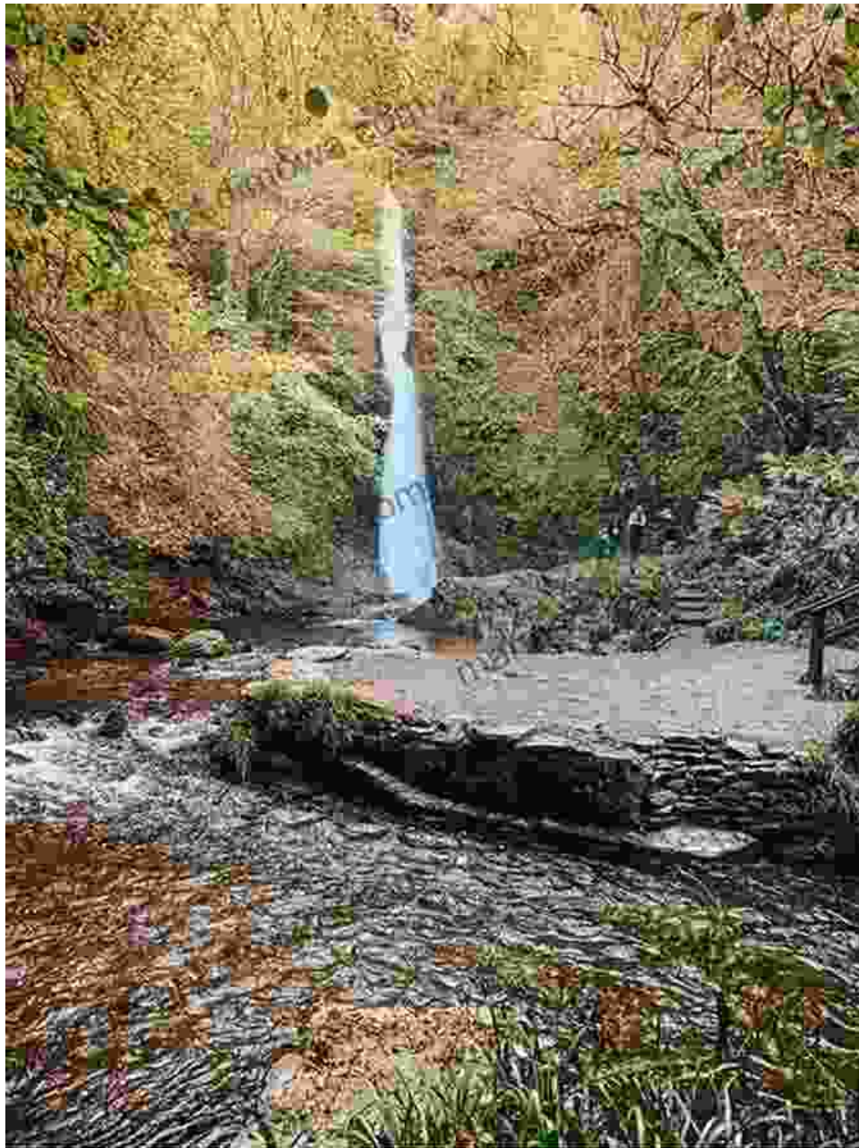
The stunning Lydford Gorge, a natural wonder carved by the power of water.