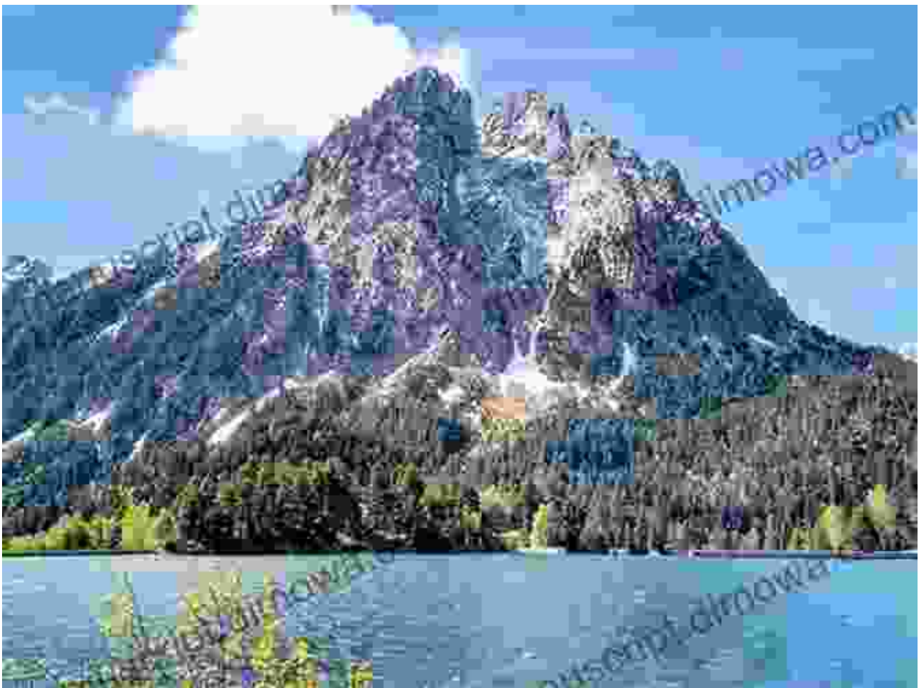
Lago de San Mauricio, a mirror of the Pyrenees

From the azure waters of Lago de San Mauricio to the emerald depths of Lago de Marboré, each lake offers a unique and breathtaking experience. The reflections of towering cliffs and lush meadows create a surreal and enchanting atmosphere, inviting you to lose yourself in the pristine beauty of the Pyrenees.