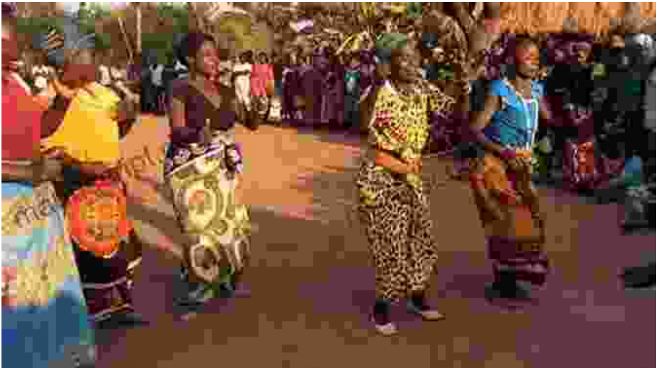
Traditional Malawian dance

Malawi is a culturally diverse country with a rich heritage. The country is home to over 10 different ethnic groups, each with its own unique traditions and customs. The Chewa people are the largest ethnic group, followed by the Lomwe, Yao, Tumbuka, and Ngoni.